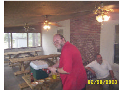
This goes good on everything! -----

The Florence Public Library was presented a number of books on radio, information about ARRL, and "how to" books on getting a license to operate on the amateur bands. The presentation was made on July 21 at 11 a.m.