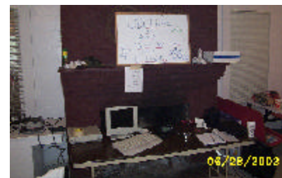
I see the computer, but did we forget the rig? -----