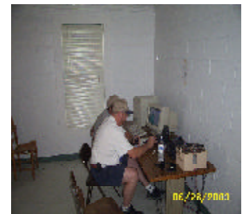
C Q field day underway at last.