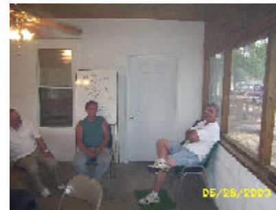
I wonder if they have the antennas up yet? -----