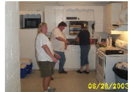
Don't tell anyone we dropped the roast on the floor?