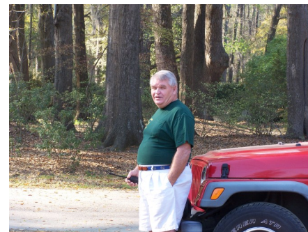
KD4BUF Enjoys the beautiful weather for the the event as he mans his station.