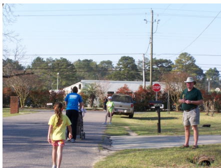
KI4TTS watches as runners pass his station on the route.