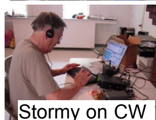
Phone & PSK Stations