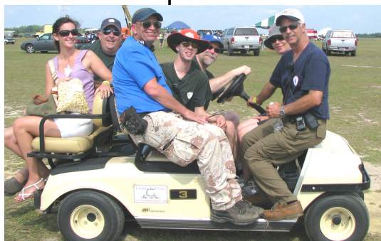
How many FARC members can you fit on one golf cart?

database on Saturday. On Sunday he came back with his new callsign KJ4VMA. I wish I had a photo of his motorcycle. The sidecar was decorated